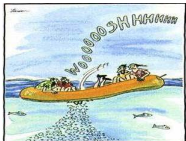
To the horror of the lifeboat's other members, Madonna loses her balance and falls on her face.

I guess at the end of the day it is also a matter of courtesy, and certainly from my experience over the last year most courses run a lot smoother if the RTC is kept in the loop – overall they work very hard and do a damn fine job and deserve everything we can do to make their job a little easier.